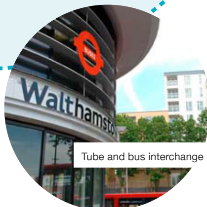
Tube and bus interchange