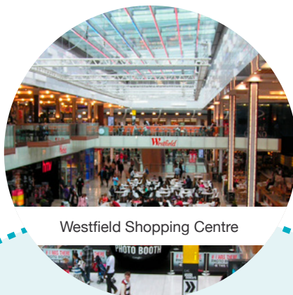
Westfield Shopping Centre