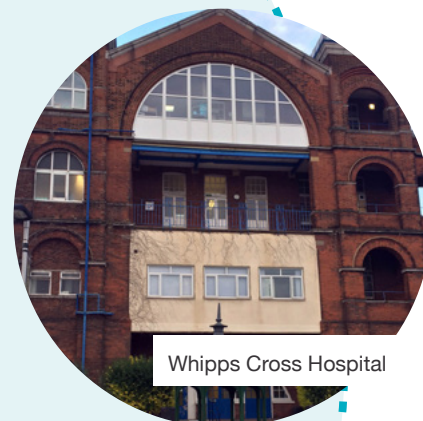
Whipps Cross Hospital